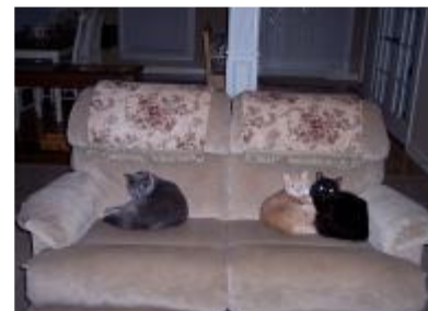
Gigi, Charleston and Buster