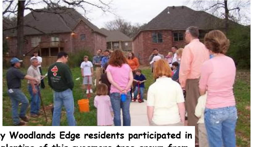
Many Woodlands Edge residents participated in the planting of this sycamore tree grown from its parent tree who's seed went to the moon!