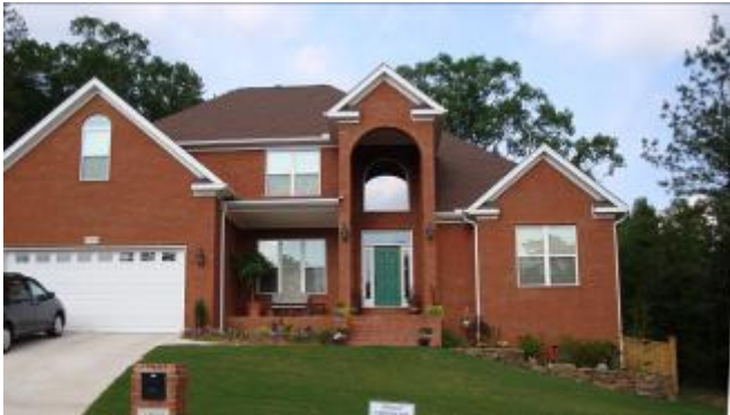
Foxfield 13700 Foxfield Land