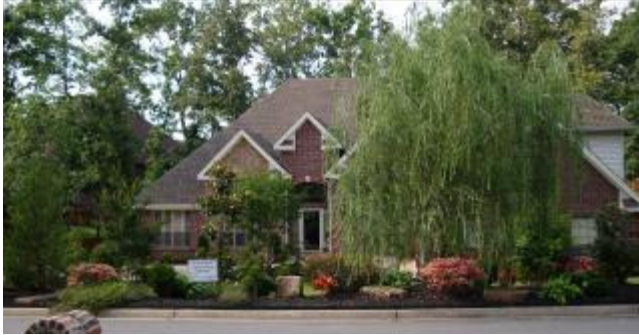
Woodgate 4 Eagle Talon