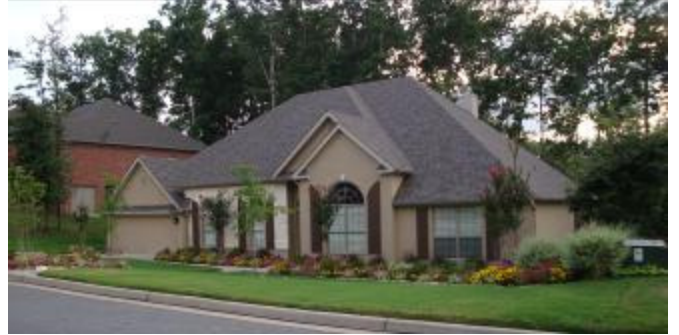
Woodgate 6 Windrush Point