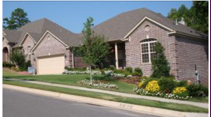
Meadows Edge 2904 Sweetgrass Drive