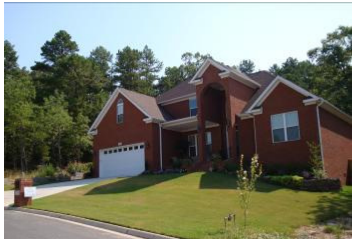
Foxfield 13700 Foxfield Lane