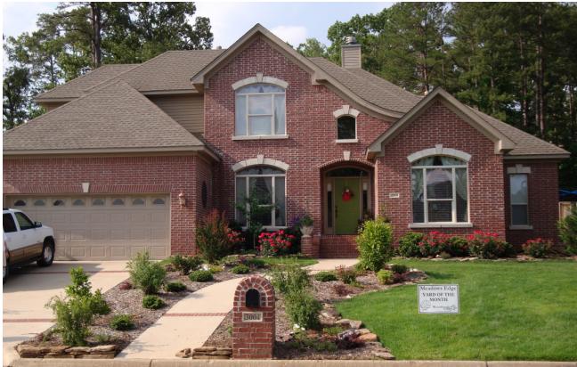
Meadows Edge 3004 Mossy Creek