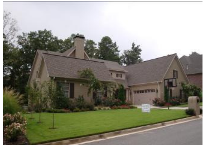
Woodsgate 9 Woodstream Cove