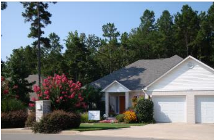
Meadows Edge 12623 Meadows Edge Lane