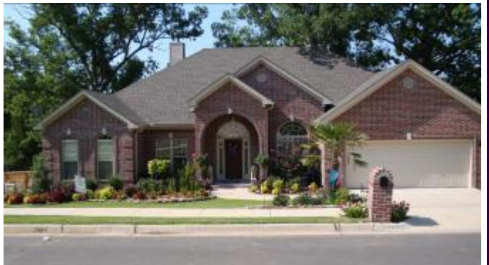
Foxfield 13505 Foxfield Land