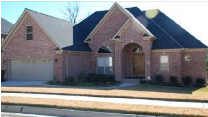
Foxfield 13519 Foxfield Lane