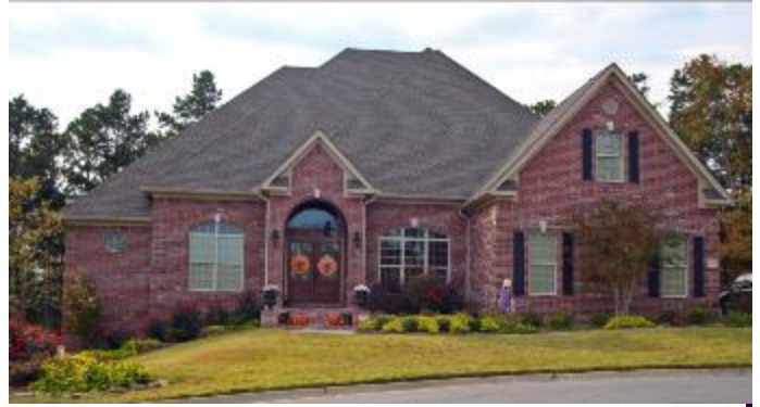
Woodgate 3430 Buckhorn Trail