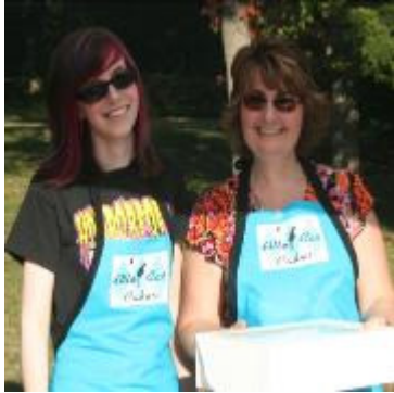
Alley Cat Cakes

Annual Halloween Carnival: The Activities Committee also sponsored the annual Halloween Carnival on October 26th. The weather was beautiful and we had a terrific turnout! There were lots of games and activities, as well as the annual costume contest.