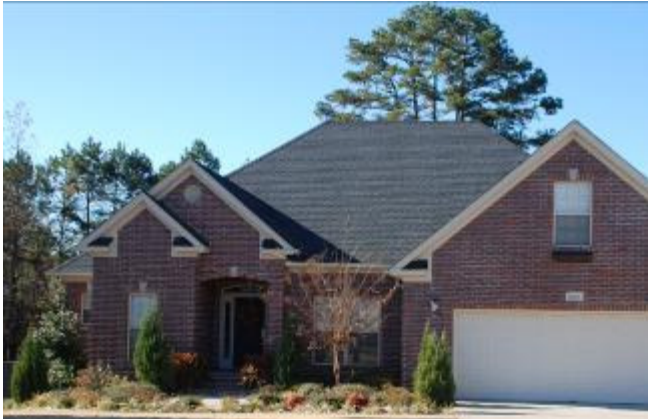
Meadows Edge 12805 Meadows Edge