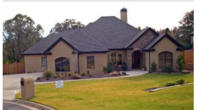
Foxfield 13303 Foxfield Lane