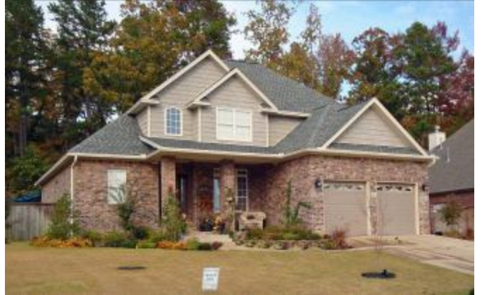
Meadows Edge 3000 Mossy Creek