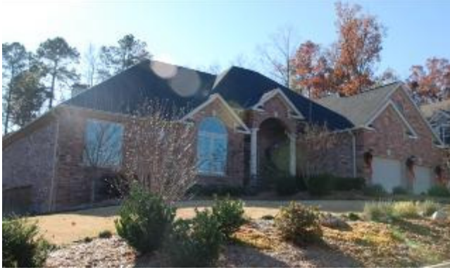
Woodgate 9 Wood Sorrell