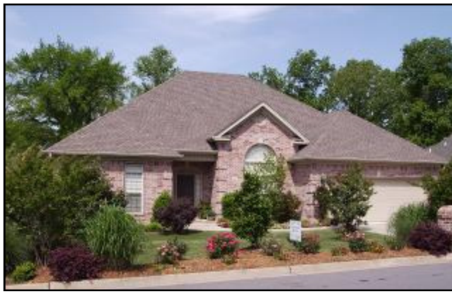
Meadows Edge 3209 Mossy Creek Drive