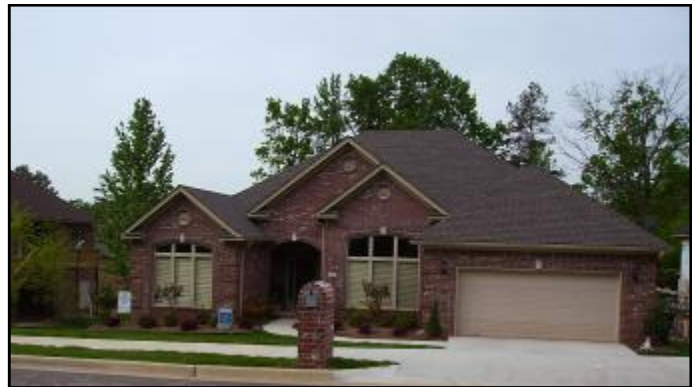
Foxfield 13407 Foxfield Lane