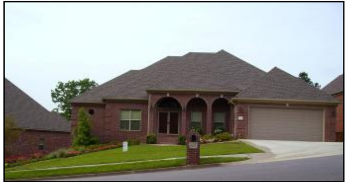
Woodsgate 3420 Buckhorn Trail