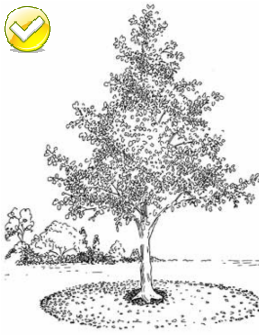
Mulch wide—not deep.

Using mulch inappropriately can actually do more harm than good! Mulch is a wonderful tool if used properly in your garden and around your trees. Here are a few tips: