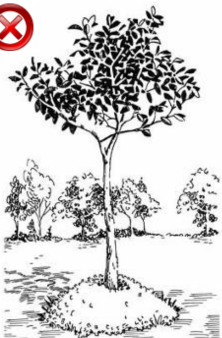
"Mulch volcanoes" cause many problems for trees.